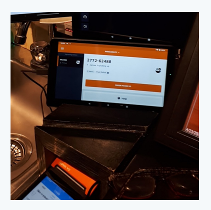
Multiple tablets are used in the restaurant for delivery platform service.

Ms. A has little confidence in the Canadian government's ability to contain the pandemic. When it first broke out, she trusted the government's plans, but as the cases increased, so did her doubt. Every day, Ms. A rinses her mouth with salt water and takes traditional Chinese medicine to reduce the likelihood of catching COVID-19. When asked